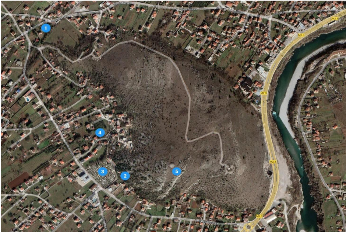
Representation of significant objects at the actual location and contact zone